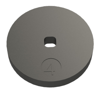
Molded Target Magnet